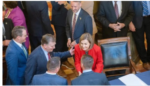
Kim Reynolds proposed a far-reaching agenda for Iowa. She got nearly everything she wanted