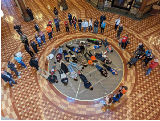
There was a student-led protest this week, against gun legislation being considered by the legislature.