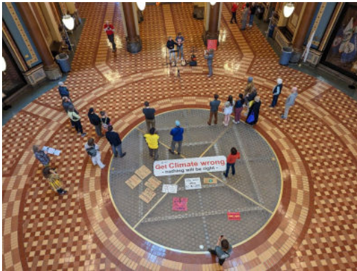
Activists came to the Statehouse this week to lobby for action to reduce the impact of climate change.