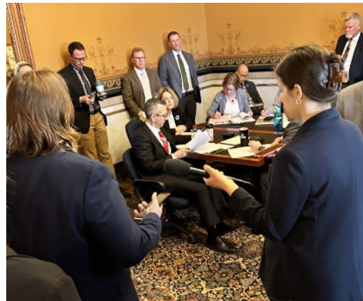
House Subcommittee on HF 613

A public hearing for SF 494 was requested by House Democrats. It has been scheduled for next Tuesday, April 4 at 9:30 am.