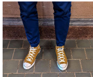
...the stars of the show!