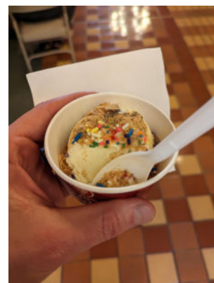
Earlier in the day, Matt treated himself to ice