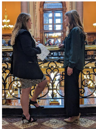
Maddy talks with Rep. Devon Wood (R-New Market)