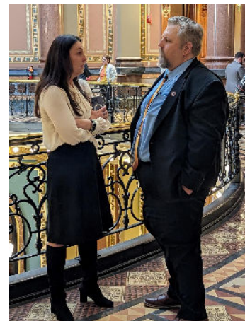
Kate with Senator Klimesh (R-Spillville)