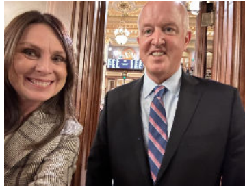
Outside the House Gallery

Okay - maybe not the best seat in the House (literally) - but they could hear really well!