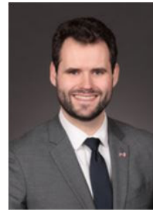
Senate Democratic Leader Zach Wahls