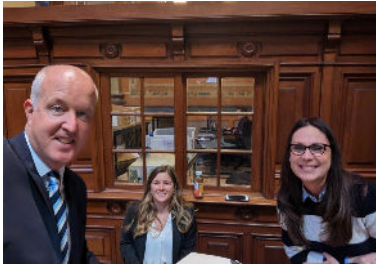
Team huddles in the AM gets the energy up!

Just a bunch of chatty Cathy's this week!